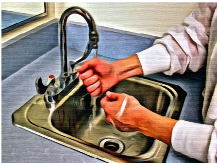
4. Rinse hands