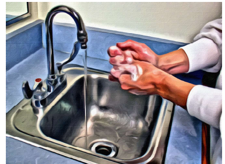
3. Rub hands together vigorously for 20 seconds