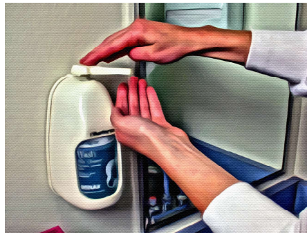
2. Apply soap