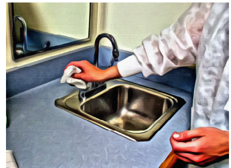
6. Turn off faucet with paper towels

Post this sign at sinks in staff bathrooms and at other sinks where staff who handle food, including bottles, wash their hands