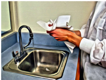
5. Dry hands with paper towels or other approved drying device